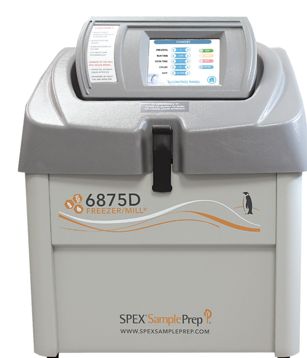
Figure 1. SPEX SamplePrep Freezer/Mill®