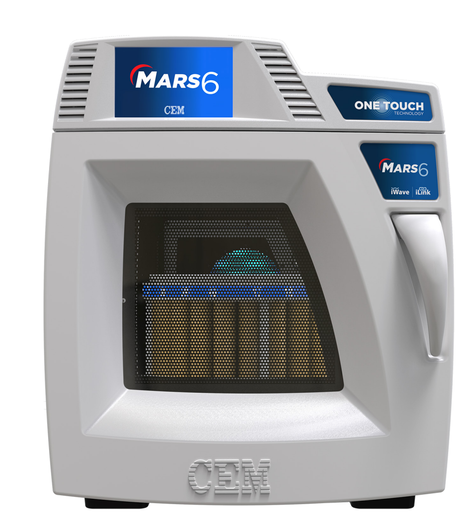
Figure 2. MARS 6 with iWave temperature sensor.