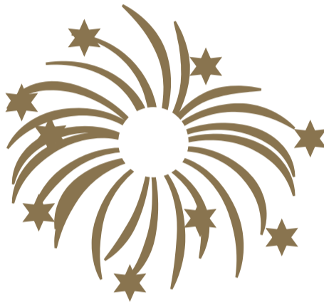
Gold: Iron (Fe)