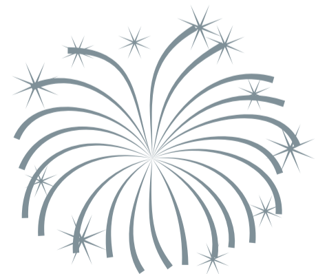
Silver: Aluminum (Al), Titanium (Ti), & Magnesium (Mg)