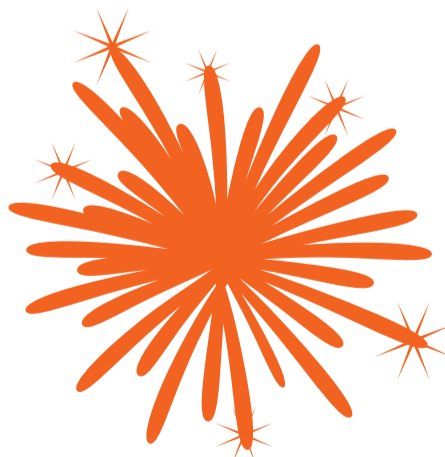
Orange: Calcium (Ca)