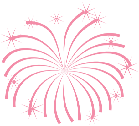
Pink: Lithium (Li)

Do you know what elements are used to create your favorite color fireworks?