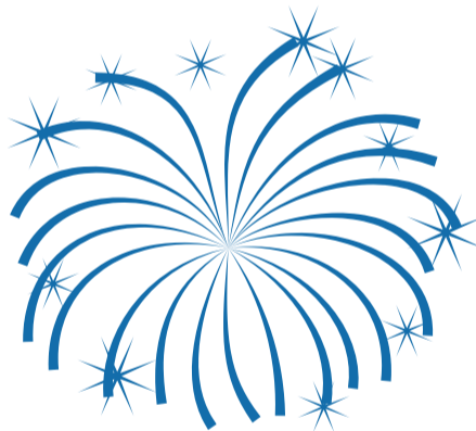
Blue: Copper (Cu)