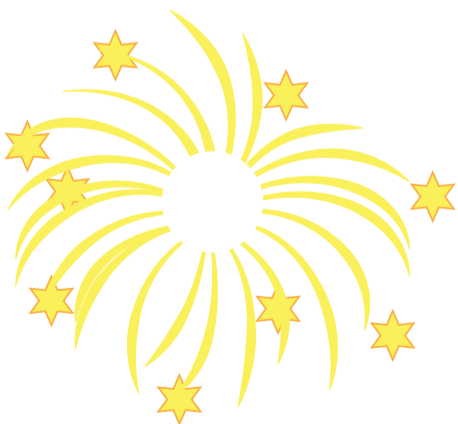
Yellow: Sodium (Na)