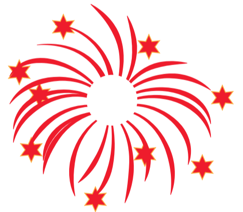
Red: Strontium (Sr)