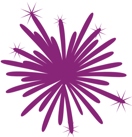
Purple: Copper (Cu) and Strontium (Sr)