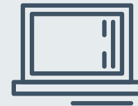
Designed for use with XRF, ICP and AA