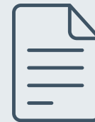
Supplied with a Certificate of Analysis