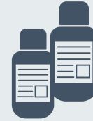
Fluxes and Additives

Spex CertiPrep has a line of pure and ultra-pure fusion fluxes and additives. Both lines are of a high purity, with the ultra-pure line having a purity of 99.998%. These fluxes are made from a 'micro bead' formula that ensures the same ratio of components in each bead with no harmful dust to clog your instruments. Our highly standardized manufacturing process produces identical batches with no appreciable lot to lot variations, thus maintaining a high level of consistency and quality.